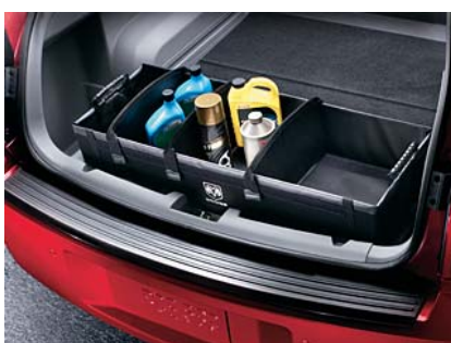
Magnum Premium Cargo Tote