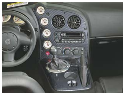
Viper Carbon Fiber Style

Interior Trim Appliques upgrade the look on the instrument panel (and door trim area on some vehicles). Available in a variety of wood, brushed aluminum or carbon fiber-style finishes(depending on vehicle application).