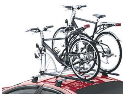
PT Cruiser, Sebring Sedan, Stratus