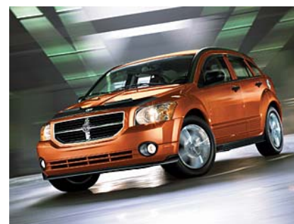
Caliber Front &amp; Side Molding and Accents