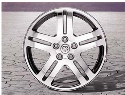
Charger, Magnum, 82209475AB