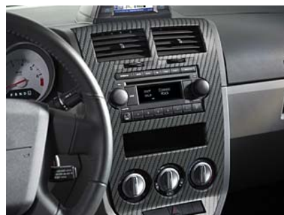
Caliber Carbon Fiber Style Center Stack