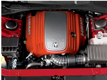
Charger Hemi Orange Style, Magnum Hemi Orange Style