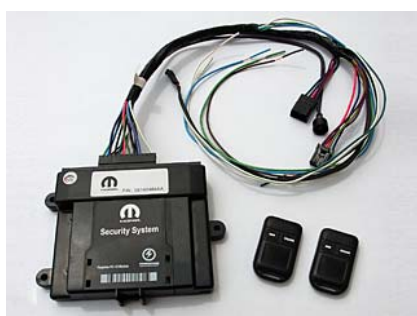
300, Caliber, PT Cruiser

Security, EVS II - For vehicles without Keyless Entry. Enjoy the protection of electronic vehicle security with Mopar EVS II Security System. The System offers exterior and interior protection and includes two, two buttonkeyfob transmitters to arm and disarm the system.