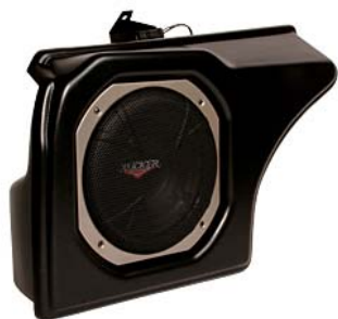
300C, Charger, Magnum

Make a dynamic difference in your vehicles sound system. Mopar Subwoofers are uniquely designed to integrate into your vehicle and enhance bass response.