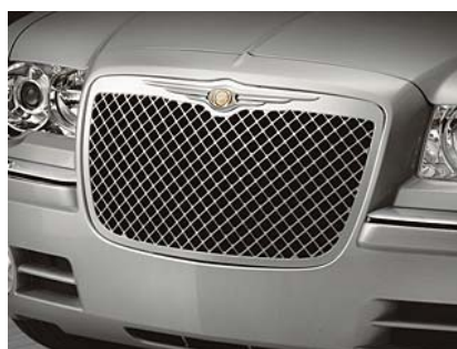
300 Chromed Billet