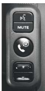
300, Caliber, Charger, Magnum, PT Cruiser

Hands-free calling is here! UConnect is the exclusive voice-activated, hands-free, in-vehicle communications system that uses a small control pad, microphone and speaker. It encourages safe vehicle operation and doesn't compromise driver control. UConnect allows you to dial your wireless phone through simple voice commands. In addition, UConnect mutes your radio before receiving or sending a call, allows you to store up to 32 names and four numbers per name (128 entries) in the system's phonebook, and is flexible enough for an entire family (up to five phones can be linked to the system). UConnect includes Bluetooth technology that enables your wireless phone to connect to your vehicle without wires or a docking station. This leading edge technology will allow you to store your wireless phone anywhere in the vehicle. UConnect is simple. All you need is a Bluetooth Hands-Free Profile wireless phone from any service provider.