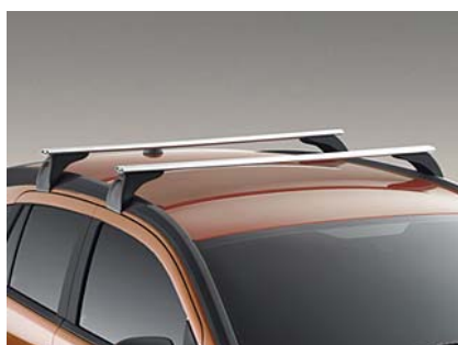
Caliber (Actual Part is Black Aluminum)

Lockable, sturdy rack attaches, detaches and stores easily. Custom installation tools are included and provide anti-theft security. For use with all Mopar Roof-top Carriers.