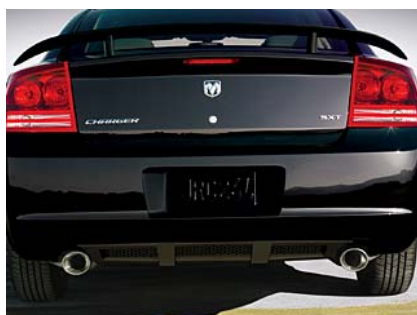
Charger Shown w/available Dual Exhaust

Add an aggressive and distinctive look to the rear fascia of your vehicle.