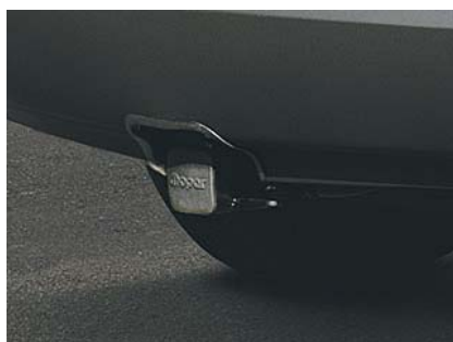
PT Cruiser, Sebring Sedan, Stratus

Receiver Plugs protect your vehicle's hitch opening from the elements. Includes a retention strap, 4-way wiring plug holder and a Jeep, Ram's Head or Mopar Logo. Made from Santoprene material, the Hitch Plug will not shrink, harden, crack, chalk or discolor.