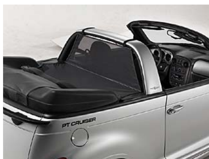
PT Cruiser Convertible