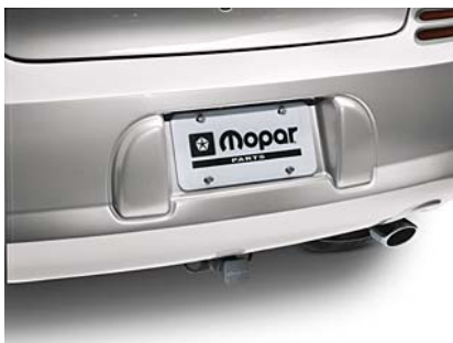
Sebring Sedan, Stratus

Designed as a one-piece welded assembly for added strength, Mopar Hitch Receivers match your vehicle's towing capacity. Covered with two-layered, E-coated paint finish to resist rust.