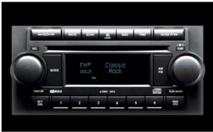
300, Caliber, Charger, Magnum

RAQ AM/FM Stereo radio with integral 6-Disc CD/MP3 Player with 66 watts of total power at 3% total harmonic distortion. 12 AM/12 FM station presets, seek and scan features, balance/fader speaker controls. Hands-free compatibility with factory UConnect system.