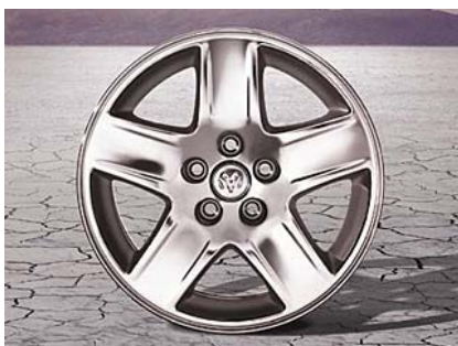
Charger (82209475AB), Magnum (82209475AB)