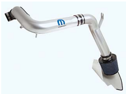
Caliber, PT Cruiser

This bolt-on system is designed to allow cooler outside air in through a directional cone filter and funnel it directly into the intake manifold. This kit provides noticeable horsepower and torque gains under varying atmospheric conditions.