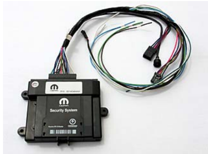
300, Charger, Magnum, PT Cruiser, Sebring Convertible

Security, EVS I - For vehicles with Remote Keyless Entry. Enjoy the convenience and peace-of-mind of electronic exterior and interior vehicle protection with Mopar EVS I Security System. Specifically designed to add security features to your existing remote keyless entry transmitter.