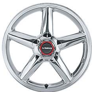
PT Cruiser (82205896)