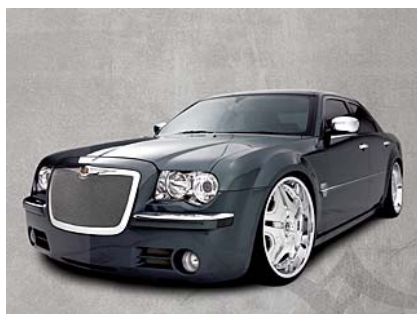
300, 300C, Magnum

Personalize your vehicle by adding chrome trim accents listed below.