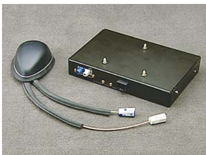
300, Caliber, Magnum, PT Cruiser, Sebring Convertible

In-vehicle entertainment has evolved with another innovative product from MOPAR. Sirius Satellite Radio will introduce a new level of depth and content to radio listening by providing up to 100 channels of digital entertainment coast to coast; 60 commercial-free channels of music and 40 channels of news, sports and entertainment. Programming varies from the Best of the 80's and Rock to Classic Jazz and Country sounds, ESPN Radio and The Weather Channel to Radio Disney and The History Channel. The system uses statistical multiplexing technology, which optimizes the fidelity on each channel, to provide superior sound resolution. The Sirius Satellite Radio System plays directly from your vehicle's radio with the installation of a special receiver and permanent mount antenna. A monthly service fee will apply.