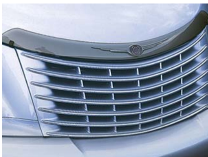
PT Cruiser, PT Cruiser Convertible

Front Air Deflectors feature a wraparound style that creates an air stream to help direct insects and road spray up and away from the hood and windshield without adversely affecting wiper or washer operation. Constructed of shatter-resistant polymers and custom molded to complement front end styling.