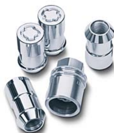
Caliber, PT Cruiser, Sebring, Stratus