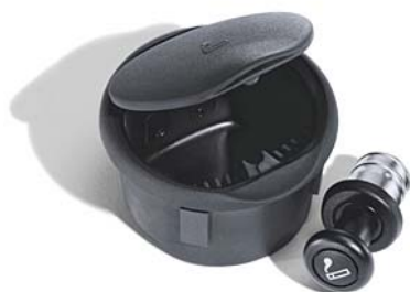
300, Caliber, Charger, Magnum, PT Cruiser

Kits available can include ash reciever, lighter, replacement knob and element.