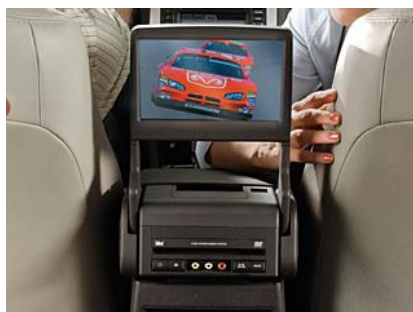
300, Charger, Magnum