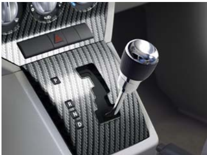
Caliber w/ Mopar Knob & Shift Surround

Mopar Billet Aluminum Shift Knobs enhance your interior's appearance. Shift Knob is a direct swap, installing easily. All hardware is included.