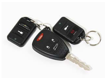
300, Caliber, Charger, Magnum, PT Cruiser

Mopar has a fully integrated, OEM tested remote start system that allows you to start your vehicle from as far away as 800 feet with just the push of a button. Imagine starting and warming your vehicle from your place of work or home on cold winter days, or cooling the same vehicle on hot summer days. Mopar's Remote Start system is designed to work with your Chrysler, Dodge and Jeep vehicle and interface seamlessly with your vehicle's electronic, security key.