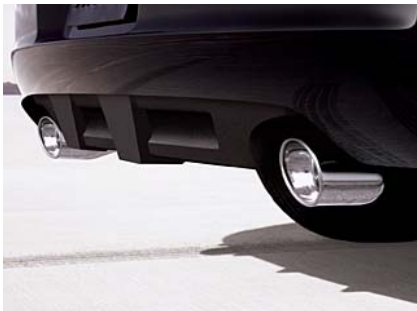
300 SRT-8, Charger SRT-8, Magnum SRT 8