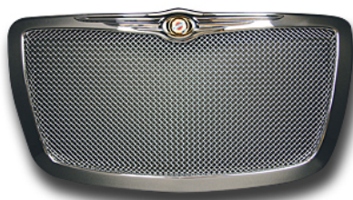
300 - DUB Grille

Give your vehicle's front end a unique and custom look. Upgraded grilles and front end appliques help enhance vehicles aesthetic appeal. All parts are designed to meet DaimlerChrysler standards for durability.