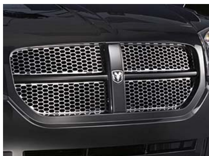
Magnum Chrome Honeycomb