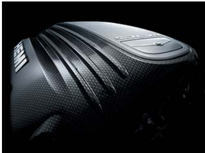
300 Black Carbon Fiber Style

Hemi Engine Cover lets you display in a not-so-subtle way that "Yeah, it's got a HEMI." Only available for the 5.7L Hemi engine.