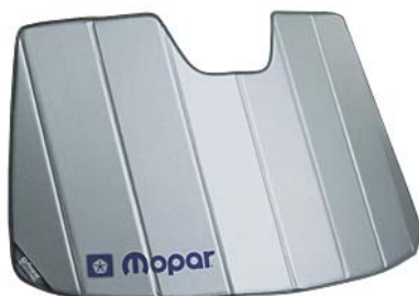
Caliber, Sebring, Stratus

Sunshade helps provide superior protection against the sun's UV rays. Installs in seconds for maximum protection.