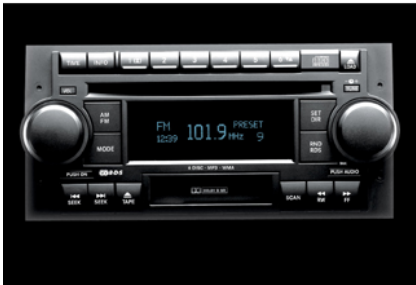
300, Caliber, Charger, Magnum

RAK AM/FM Stereo with cassette and integral 6-disc CD/MP3 player. Provides 66 watts of total power at 3% total harmonic distortion. 12 AM/12 FM station presets, seek and scan features, balance/fader controls