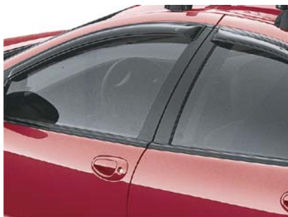
PT Cruiser, Sebring Sedan, Stratus