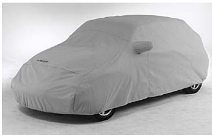
PT Cruiser Convertible

Vehicle Cover helps protect your vehicle's finish from UV rays, dirt and other airborne pollutants. Made of premium material (Evolution®, Weathershield® or Matrix®) that is washable, heavy weight, breathable and water resistant. Custom contoured, this cover features double-stitched seams and elasticized bottom edges at the front and rear. Clear rear license plate window and tie-down grommets standard.