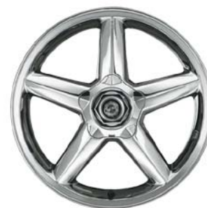
Sebring (82206782), Stratus (82206783)