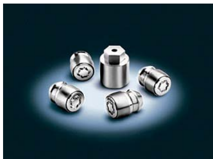
300, Charger, Magnum

Wheel Locks (available for most models) and exclusive Mopar key codes helps ensure maximum protection. Available in one- and two-piece styles, for both steel and aluminum wheels. Each Wheel Lock kit includes four or five chrome-plated locking nuts, and one exclusive Mopar key. Wheel Lock kits help protect against wheel and tire theft without effecting wheel balance.