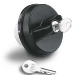
Caliber, PT Cruiser, Sebring, Stratus

Locking Gas Cap helps guard against theft or contamination of fuel. Constructed of plastic with stainless steel key and lock, the design features sturdy construction to meet Federal Fuel Safety Standards for fuel leakage. Kit includes a black quick on/off, quarter-turn, locking gas cap and two keys.