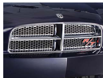
Charger (Shown with R/T Provisions)