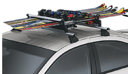
PT Cruiser, Sebring Sedan, Stratus