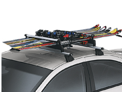
Sebring Sedan, Stratus