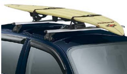
PT Cruiser, Sebring Sedan, Stratus

Water Sports Carrier transports a kayak, surfboard or sailboard. It attaches easily to Sport-Utility Bars (sold separately) and has multiposition cradles to fit flat or curved hulls. Carrier comes complete with latching, push-button nylon strap to retain cargo.