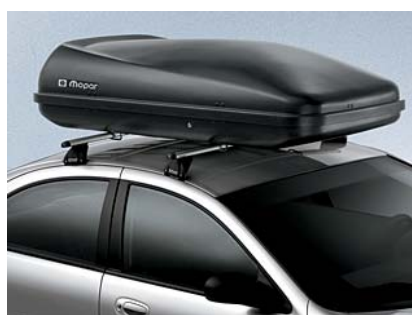
Sebring Sedan, Stratus