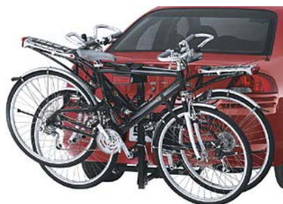
PT Cruiser, Sebring, Stratus

Hitch-Mount Bicycle Carrier holds bikes securely off the back of your vehicle by mounting into a Hitch Receiver. The Carrier installs and removes in seconds, and also folds down to allow entry into the rear hatch. The Carrier holds any bike with a horizontal crossbar (men's style). Bikes without horizontal crossbars (women's style) require a Frame Adapter (sold separately-82207941). Carriers are available to hold two or four bikes.